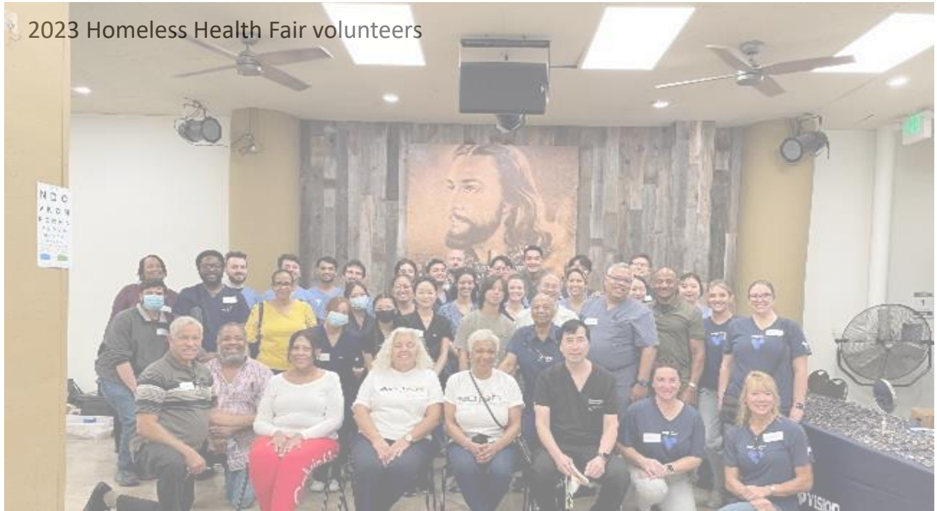
2023 Homeless Health Fair volunteers