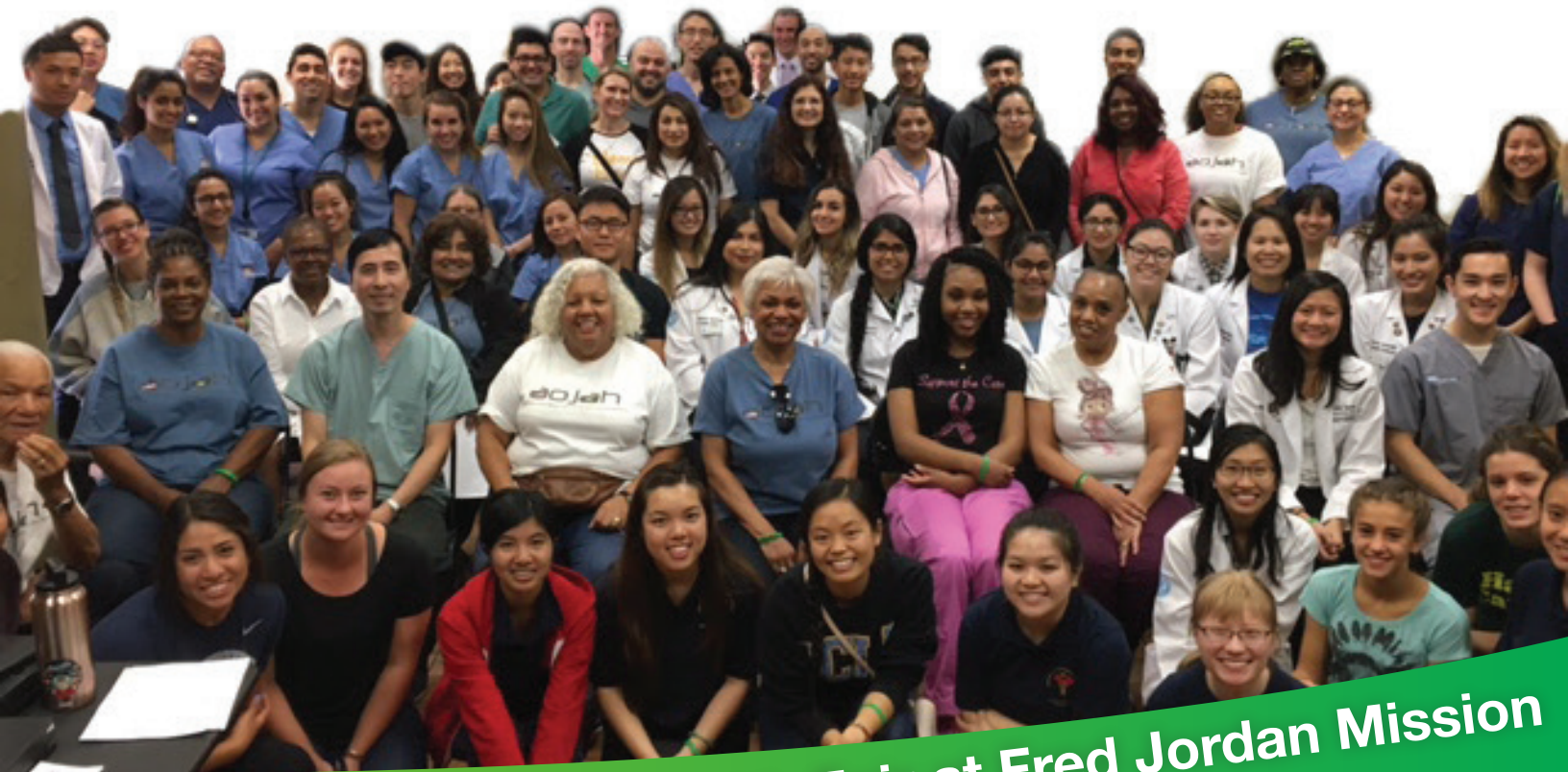
Health Fair at Fred Jordan Mission

Are you interested in becoming a Board Member? 2018 is the year for election! Positions up for election are – President, Executive Vice President, Treasurer and Secretary. The position requirement will be sent to all current members via email.