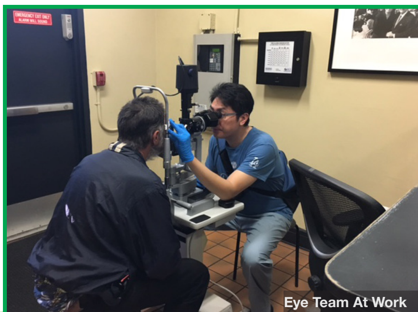
Eye Team At Work