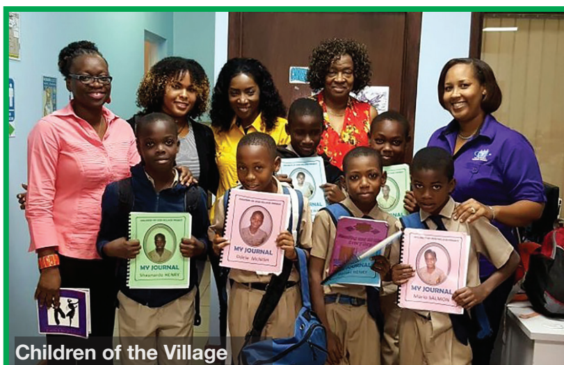
Children of the Village